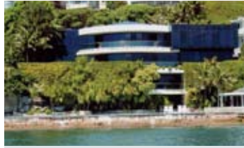
Q2. 9 Wolseley Crescent, Point Piper SOLD for $24 million