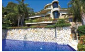
Q1. 110 Wolseley Road, Point Piper SOLD for $20.6 million