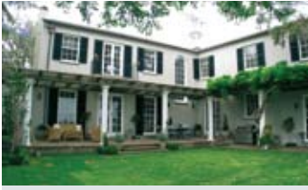
Q1. 20 The Crescent, Vaucluse SOLD for $11 million