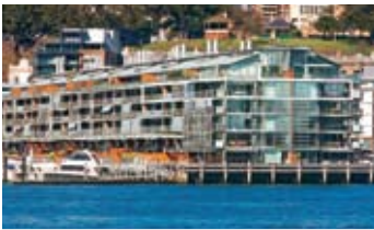
Q3. 528/19 Hickson Road, Walsh Bay SOLD for $16 million*