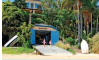
Q1. 50 The Crescent, Vaucluse SOLD for $16.1 million