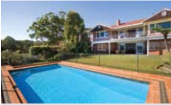
Q1. 2 Loch Maree Place, Vaucluse SOLD for $12.5 million