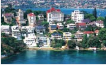
Q3. 42a Wolseley Road, Point Piper SOLD for $12.5 million