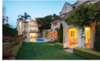
Q3. 7 Rose Bay Avenue, Bellevue Hill SOLD for $15.7 million