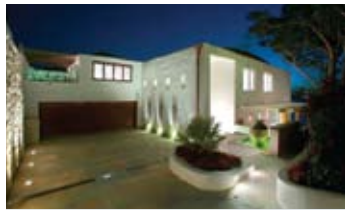
Q4. 2 Bayview Hill Road, Rose Bay SOLD for $18-$18.5 million