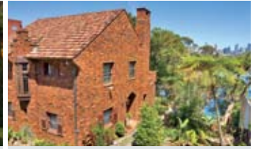
Q4. 88 Wolseley Road, Point Piper SOLD for $16 million*