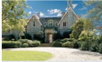
Q4. 2&6 Ginahgulla Rd & 49 Fairfax Rd, Point Piper SOLD for $20.5 million