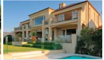
Q2. 9 Wentworth Place, Point Piper SOLD for $13.8 million