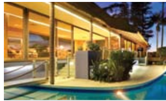
Q3. 22D Vaucluse Road, Vaucluse SOLD for $29 million