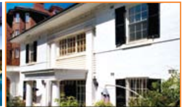
Q4. 26-28 Wolseley Road, Point Piper SOLD for $25 million