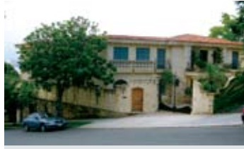
Q2. 63 Wolseley Road, Point Piper SOLD for $21.5 million